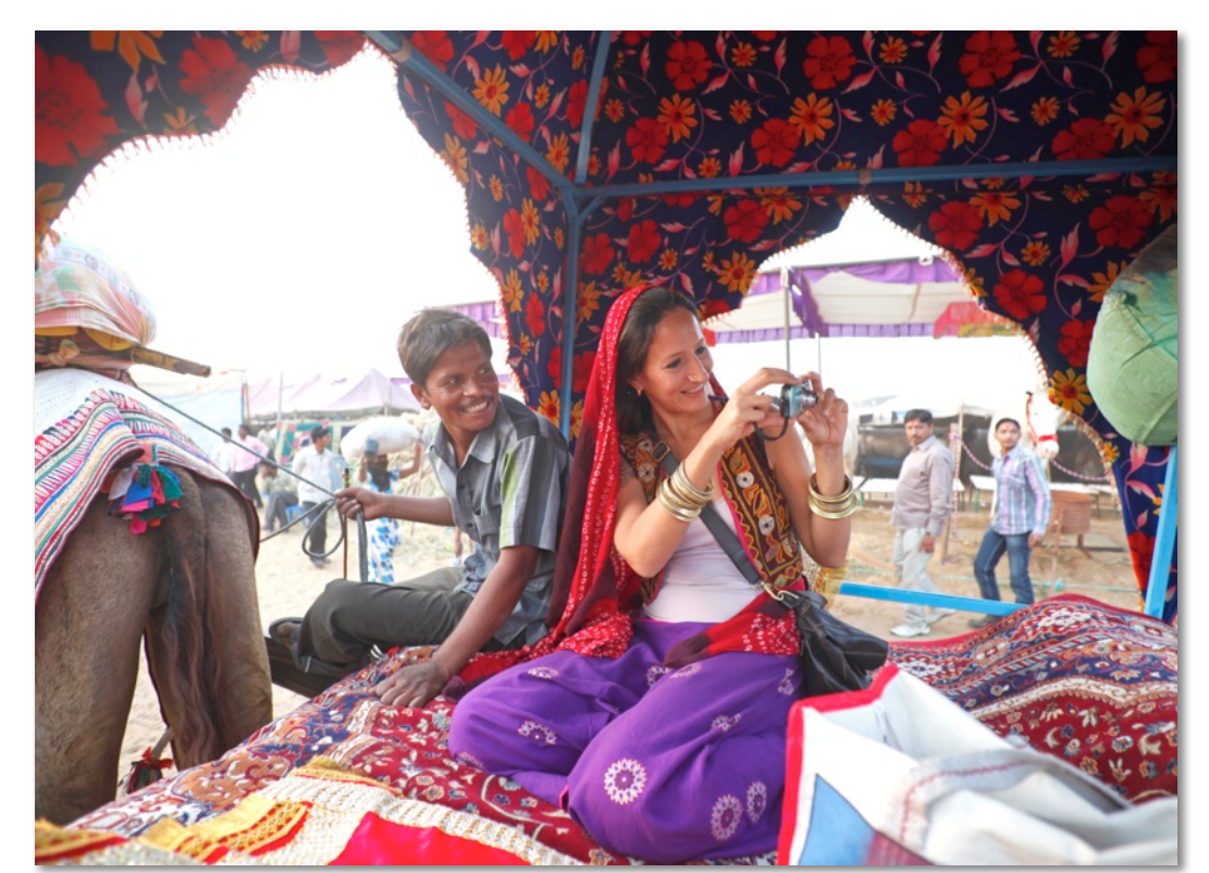
PEOPLE & CULTURE - WILDLIFE - TRAVEL - FESTIVALS - STREET PHOTOGRAPHY